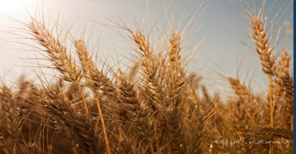
"Working with our Rural & Coastal Communities"