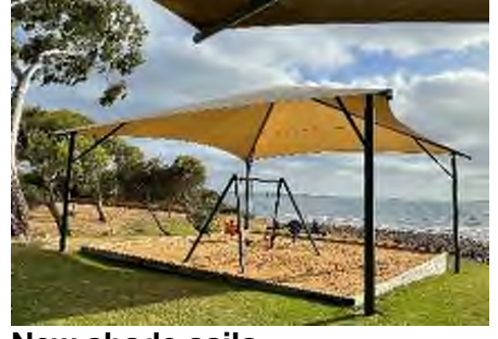
New shade sails

Shades have recently been installed at Dorward Reserve, North Shields, Morgan Reserve in Coffin Bay and Lions Picnic Spot, Boston.