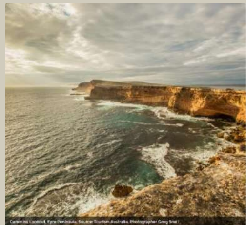
Cummins Lookout, Eyre Peninsula

The bit that is a bonus is the community side of it including designing and delivering care in a team-based approach."