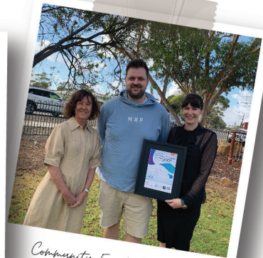
Community Event of the Year 1802 OYSTER BAR KANGAROO ISLAND BUSHFIRE FUNDRAISER