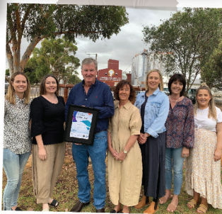
Business of the Year LOWER EYRE FAMILY PRACTICE