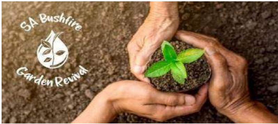
South Australian Bushfire Garden Revival Lower Eyre Peninsula

Putting the call out to gardeners and for donations of plants, garden tools and anything garden related