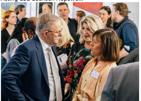
Photo: Prime Minister Albanese & Mayor Quigley conversing on the opportunities for the Eyre Peninsula.

Lower Eyre Council is positioning its community and assets to benefit from the future export potential through leveraging the Port Lincoln Airport as a critical piece of regional infrastructure, while advancements in aquaculture and agricultural industries, and emerging sectors such as large scale, methane reducing, seaweed farming and eco-tourism luxury product development support the value of the Eyre Peninsula as an integral economic region!